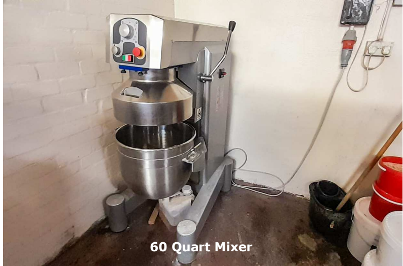
60 Quart Mixer