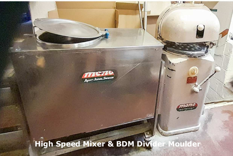
High Speed Mixer & BDM Divider Moulder